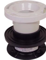
Note: Closet Flange Not Included